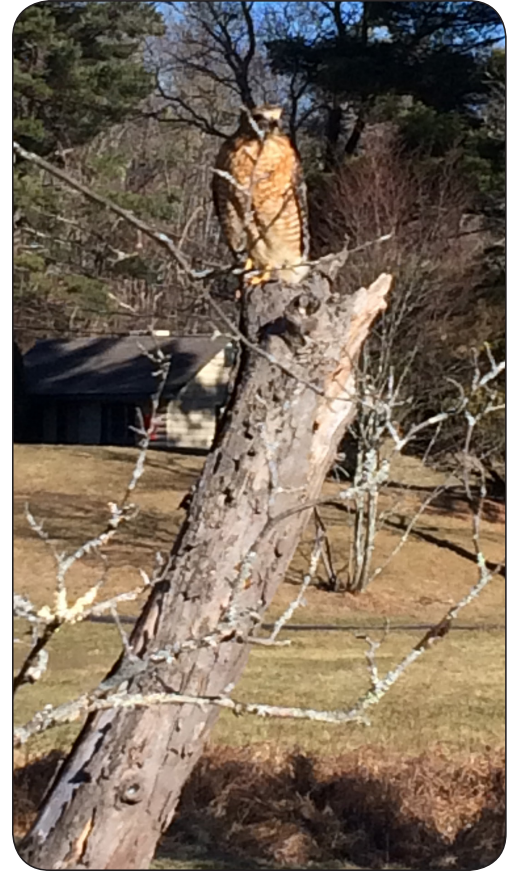
Red Shouldered Hawk perched on top of broken tree

If successful in raising their kids, the pair of Red Shouldered Hawks will return in future years to the same nest or build a new one nearby. The kids, once they are adults, practice imprinting, which means they return to the general area where they were born to find a mate and start the cycle again. For PEEC, the Poconos, and the Delaware Water Gap National Recreational Area, the presence of the Red Shouldered Hawk is a sign of a healthy and wild ecosystem. Enjoy!